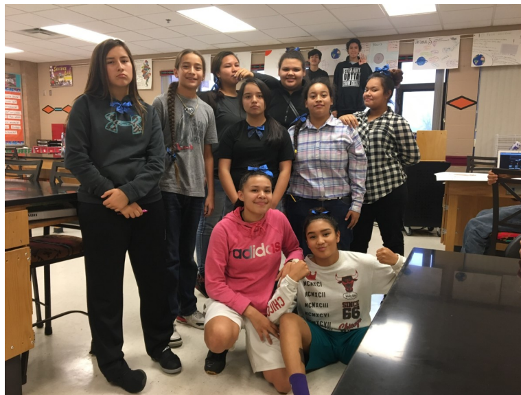
At the time of decorating our classroom wazican, 8th grade students decided to wear the blue bows instead of placing them on the tree!

8th Grade — Completed another unit on Geometry and are in the middle of their Algebra unit. They are expected to be able to solve equations like: 4x + 2(x-3) - 4 + 8x = -6x - (4x+3)5-8 !