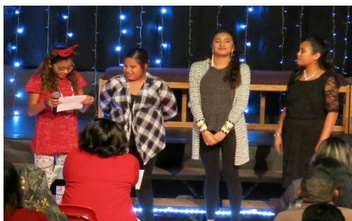
MS Students hosting xmas program.

6th Grade — In 6 th grade, we have finished Egypt and moved into India. We had a lot of fun doing web quest on Egypt and using Quizlet in the classroom. We also have been using technology such as google forms, Quizlet, and Socratives to get immediate feedback during class.