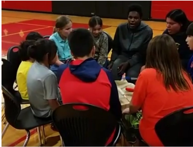
The drum and the Dakota Culture are essential to our Middle School.