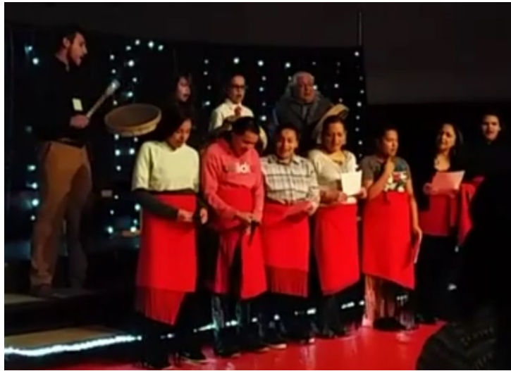
It's good to have a Christmas Drum song in the Christmas Program!